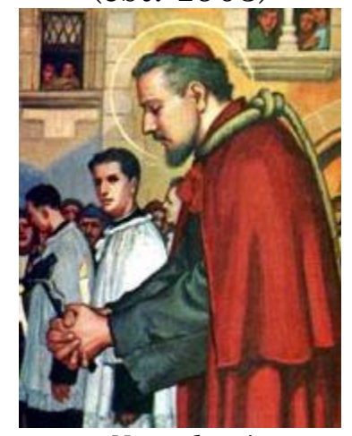
November 4 Patron of Seminarians and Catechists

Oh God, Maintain in your people that spirit with which you inspired your Bishop St. Charles, so that your church may be constantly renewed, conforming itself to Christ and manifesting Christ to the world.