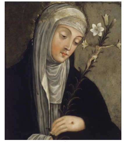
April 29 Patron of Nurses

St. Catherine of Siena Parish (est. 1892)